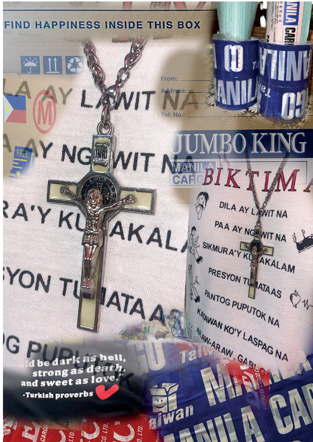
Find happiness inside this box